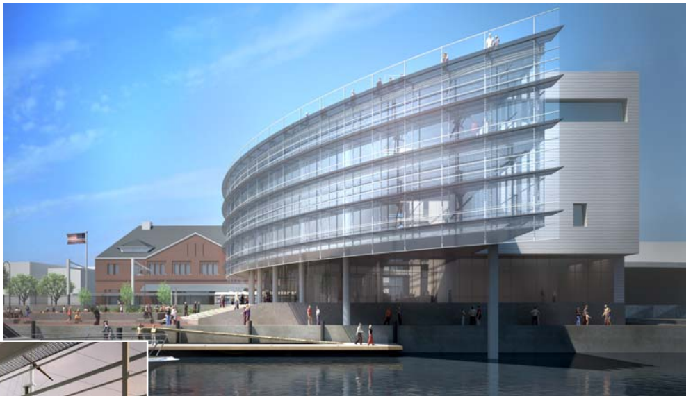
Renderings courtesy: PAYETTE.

The Board of Directors of the National Coast Guard Museum Association, Inc. reviewed and approved new renderings of the building that will encompass all facets of the United States Coast Guard – land, sea and air. The Museum will take full advantage of its location on the New London, Connecticut waterfront by incorporating a pier for America's tall ship U.S. Coast Guard Barque EAGLE and display Coast Guard aircraft on the rooftop.